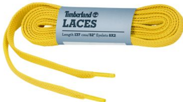
52-inch Flat Replacement Laces $5.00

https://www.timberland.com/shop/52-inch-flat-replacement-laces-pc033714