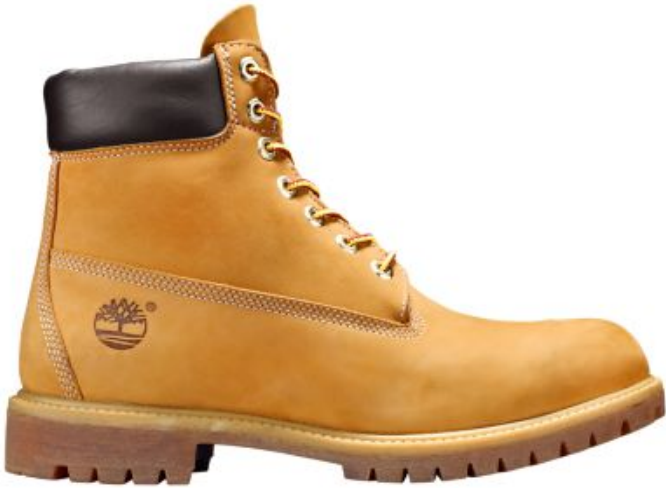
Men's 6-Inch Premium Waterproof Boots $190.00

https://www.timberland.com/shop/mens-6-inch-premium-waterproof-boots-wheat-10061024