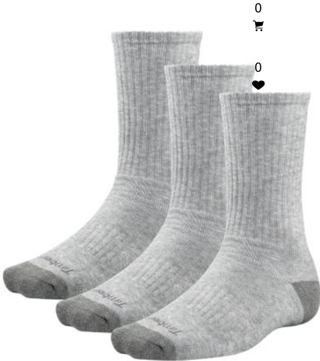
Men's Multi-Purpose Crew Socks (3-Pack) $18.00

https://www.timberland.com/shop/womens-6-inch-premium-waterproof-boots-10361024