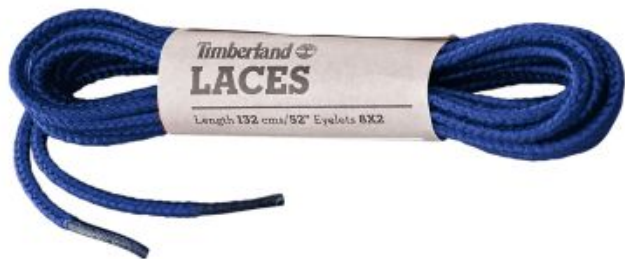
52-inch Round Replacement Laces $5.00

https://www.timberland.com/shop/52-inch-round-replacement-laces-pc032538