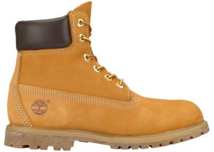
Women's 6-Inch Premium Waterproof Boots $170.00

https://www.timberland.com/shop/mens-6-inch-premium-waterproof-boots-wheat-10061024