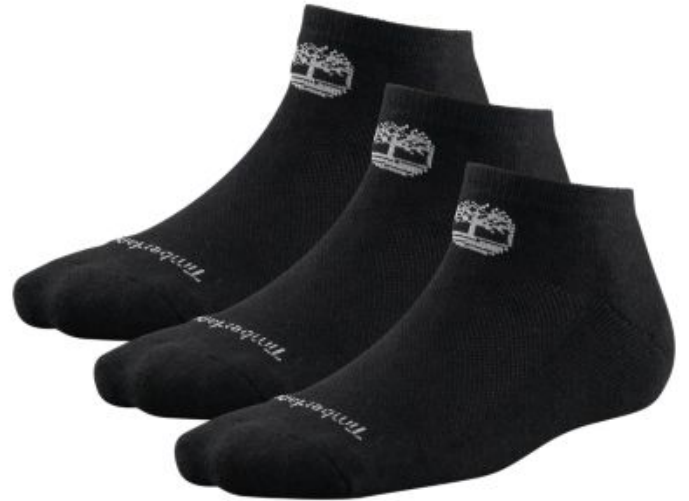
Women's Textured Low Rider Socks (3-Pack) $12.00

https://www.timberland.com/shop/mens-multi-purpose-crew-sock-3-pack-im405020